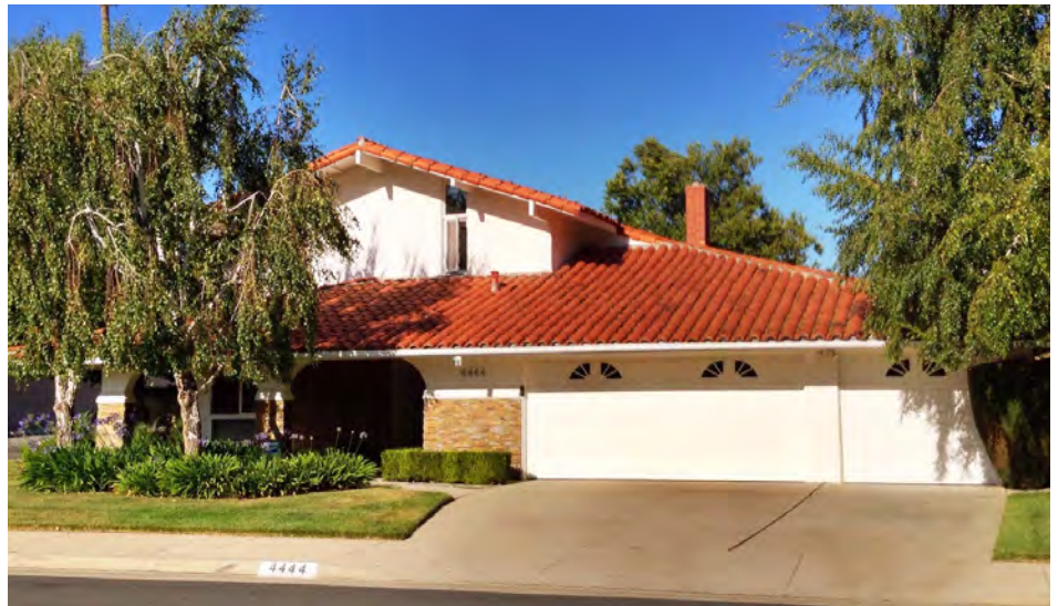
Beautiful Home ~ 4444 Henley Court

Hopefully El Nino will appear and the drought will be over next rainy season. In the meantime our Greenbelt can at least stay relatively green. Keep saving water neighbors, and if anybody knows a good rain dance, well, start dancing.